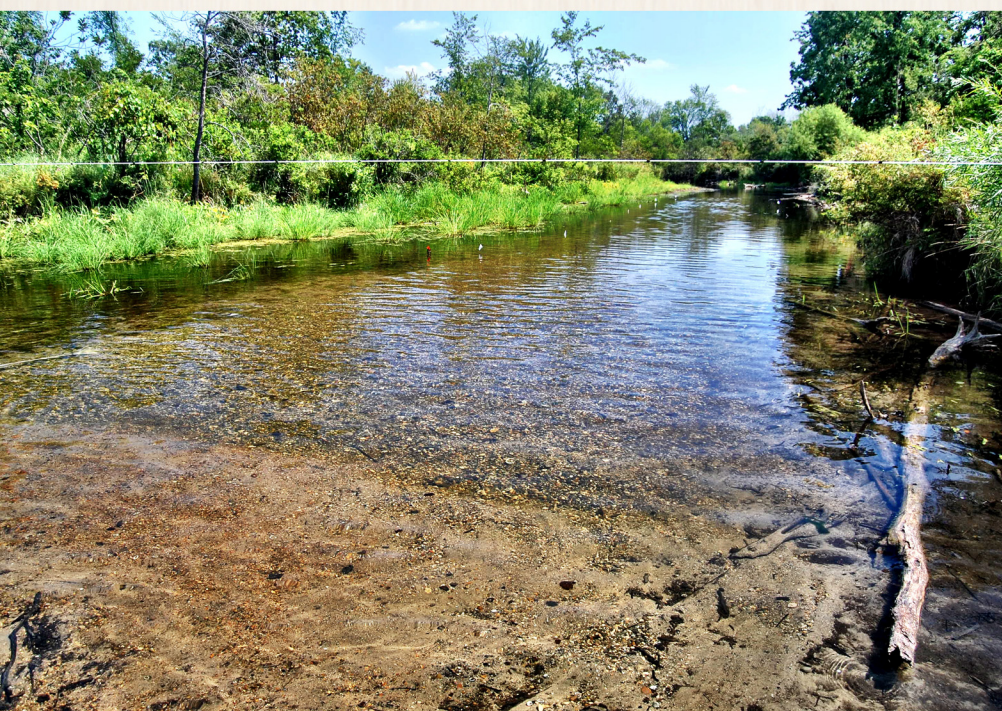
The Invasion of Harmful Sediments